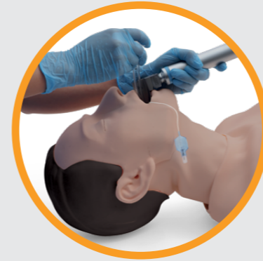
Practice intubation using basic to advanced airway management devices