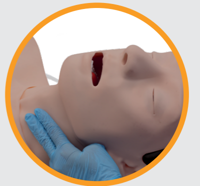
Automated pulse, synchronized with heart rate