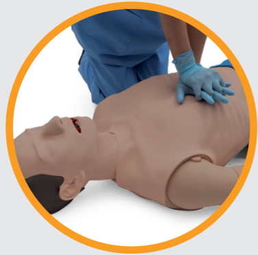
High quality CPR