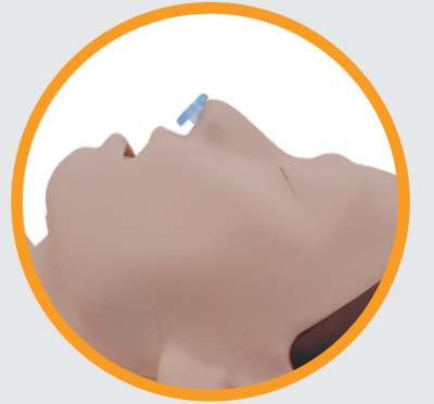
Nasal intubation (NPA, ETT)