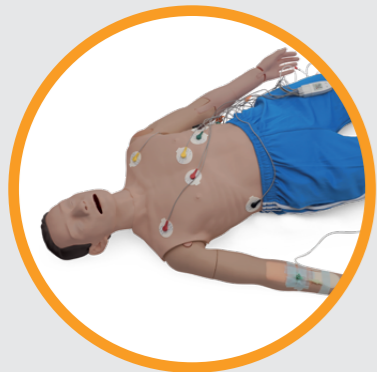
12-Lead ECG placement