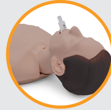
Oral intubation (OPA, iGel, LMA, LT, ETT)