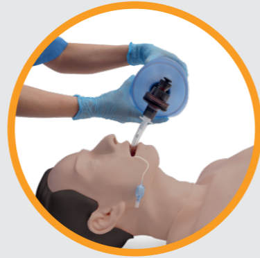
Ventilation with real-time feedback