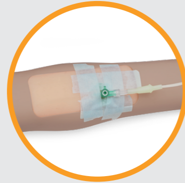
IV cannulation site