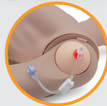
Humeral IO site